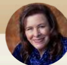
Co-Founder, Human Potential Movement; Chancellor Meridian University