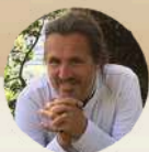
Co-Founder Home for Humanity Prof. Da Vinci Institute