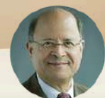
Former UN Under Secretary- General; Former Head of UN Peace Operations