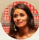
Co-Founder Home for Humanity; Founder Oxford Enacting Global Transformation